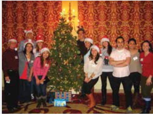
RCT- 2012 Children's Christmas Party

As a club that also prides itself on the events and projects it has created for causes close to the hearts of its members, the Rotaract Club of Toronto has established its own annual traditions including: