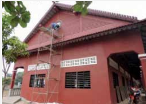
The IT Building

The Rotary Club of Toronto, as part of their Centennial celebration, made a donation of $100,000 (Cdn) to the project.