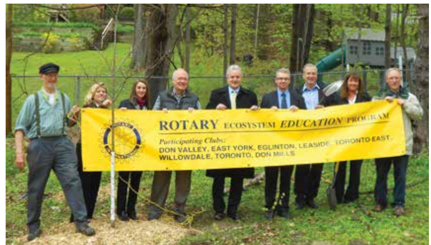
A Gaggle of members from Toronto-area Rotary Clubs celebrate another Earth Day Ecosystem Project.

What else can we do as individuals and as a club to benefit our environment? The Environmental Sub-committee is always looking for new ideas and members.