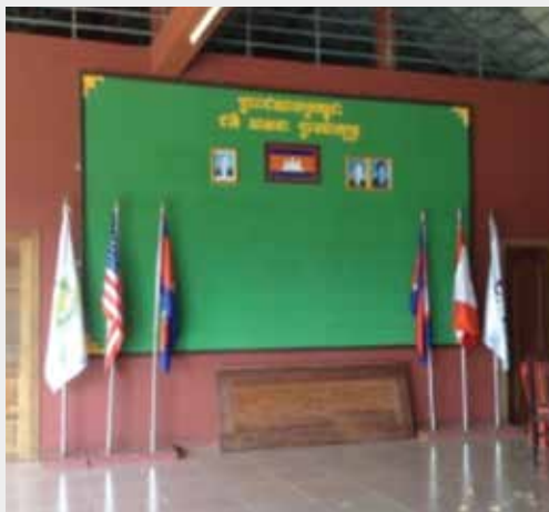
Flags including Rotary

We had access to review the progress of the construction and were pleased to see that Buildings 1 and 2 (the general pavilion and dining area and the library and administration centre) are substantially complete. Building 3, the washroom facility, is ready for installation of plumbing fixtures. Building 4, consisting of five classrooms funded by RCT, and Building 5, a bicycle repair and small motors teaching facility for landmine victims funded by the CLMF, are both progressing well. The contractor is committed to finishing them within the existing budgets.