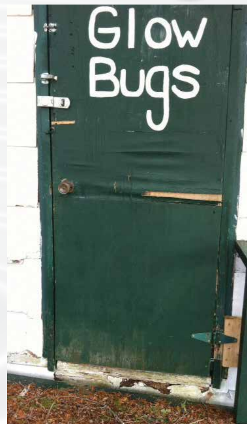
One of many carpentering and painting projects at Camp Scugog

By signing up now you will help me determine what we can accomplish at Camp this year. Do it now at this link: http://tinyurl.com/l44ovom