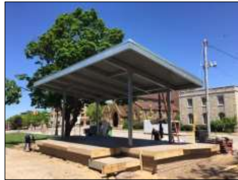
Hackley Park Stage