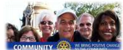
COMMUNITY WE BRING POSITIVE CHANGE TO THE COMMUNITY