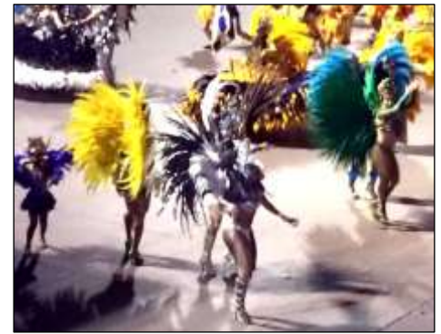
Celebrations in Brazil awaited our Rotary contingent getting ready to attend RI's international convention.