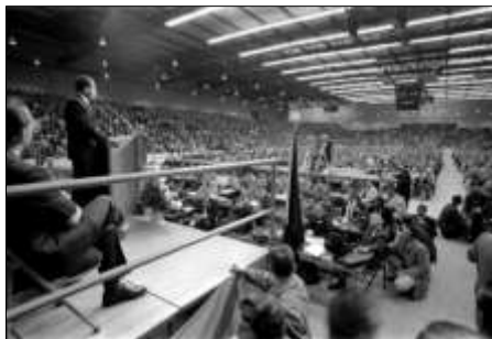
Nearly 66 years ago, on Oct. 27, 1960, Richard Nixon addressed the crowd at the dedication of the L.C. Walker Arena less than two weeks before Election Day in which he lost to John F. Kennedy .