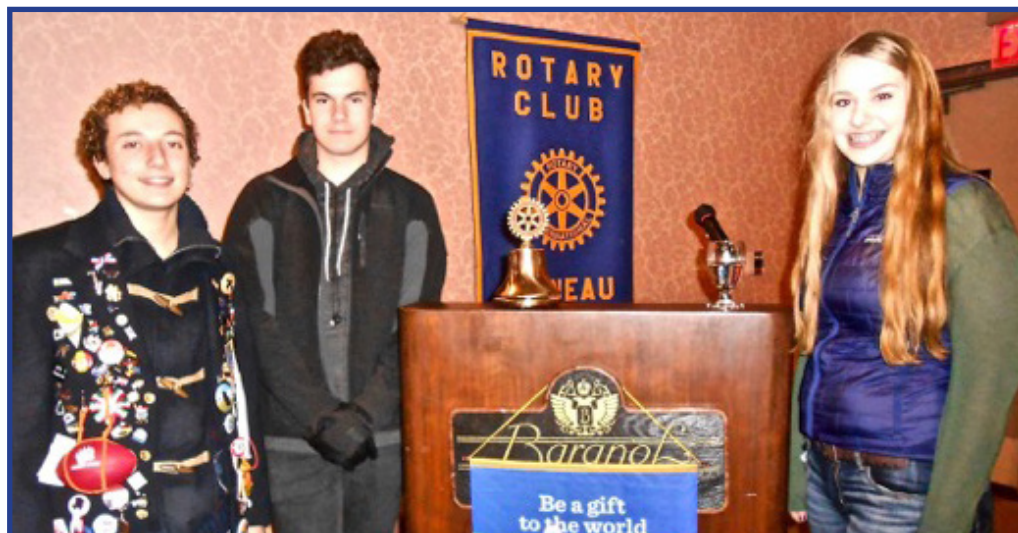
Exchange students (inbounds and outbounds) at the November 17, 2015 meeting.