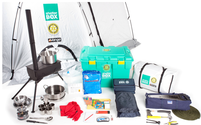
Typical shelter box and supplies

as its millennium project. "Little did they know that it would become the largest Rotary club project in the world, with affiliates in countries across the globe... In 2005, ShelterBox sent out more than 22,000 boxes, almost 10 times the number delivered in the previous three years... (becoming) a major player in the field of international disaster relief."