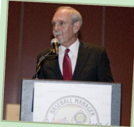
Jim Leyland, Manger of the Detroit Tigers and 2011 Chuck Tanner Manager of the Year