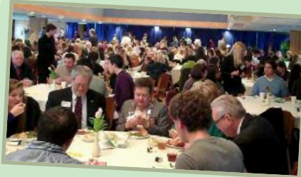
Some of the 300 Ethics Symposium attendees enjoying lunch at Duquesne University