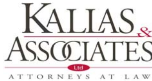
ATTORNEYS AT LAW