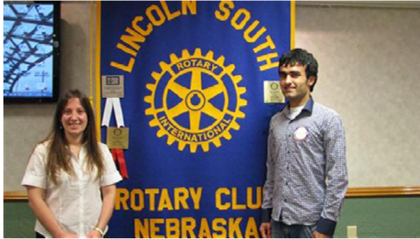
Tea and Khayom

Mantu is called the national food. Shurbo is a soup. Tajik bread is very popular and considered an important staple of their foods.