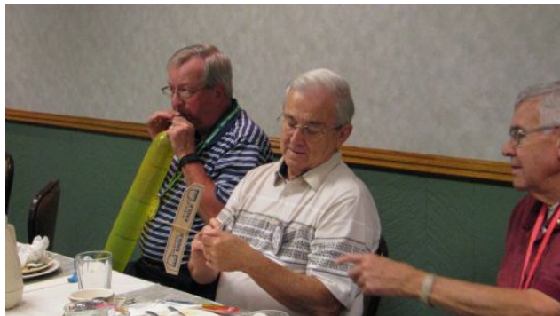
Having some fun!