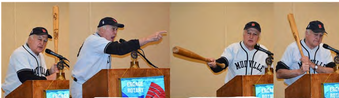
"It looked extremely rocky for the Mudville nine that day. The score stood 2 to 4 with but one inning left to play"