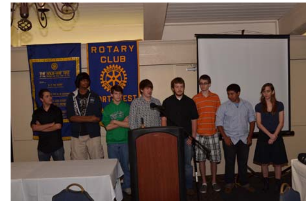
Members of the Westwood H.S. Interact Club led our March 23 rd meeting.