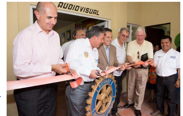
Ever wonder why we raise funds with the fruit sale? Here's an example: NWAR and Monterrey Obispado clubs funded a joint project for a much-needed computer lab in a Monterrey school. Here, members from both clubs participate in the lab's ribbon cutting ceremony.

Rehema Orphanage Grid Earth PET Austin ShelterBox Libraries of Love Global Grant Scholars