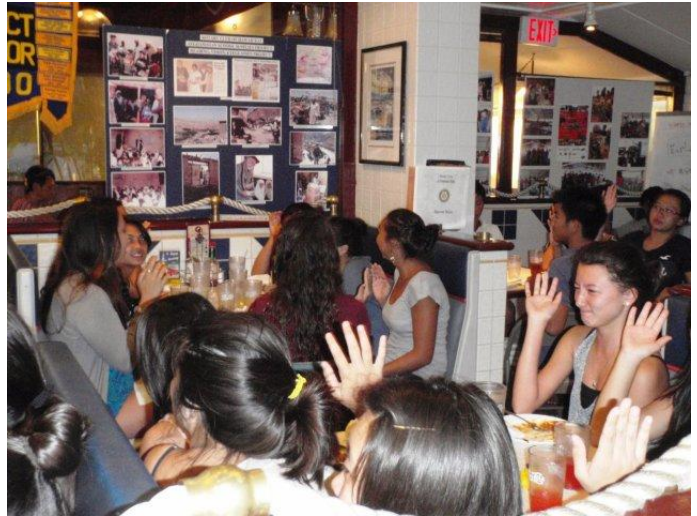
Swearing in ceremony