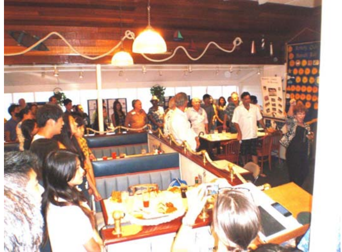
4 Way Test