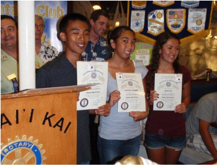
Directors displaying their Certificates issued at our meeting to each and every Interact member.