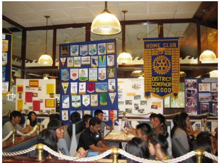
Interact members enjoying their Dinner