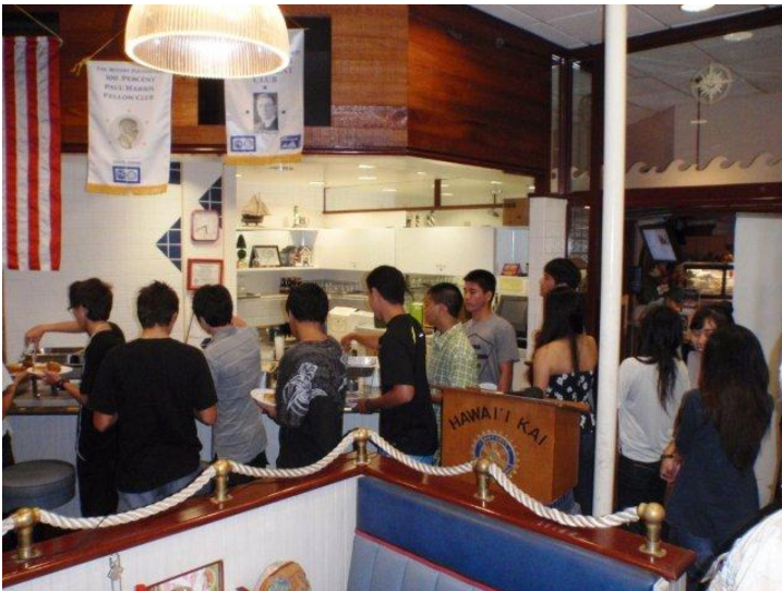
Feeding the multitudes