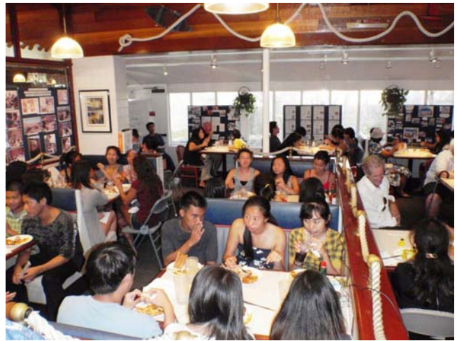
Interact Students Enjoying their Meal