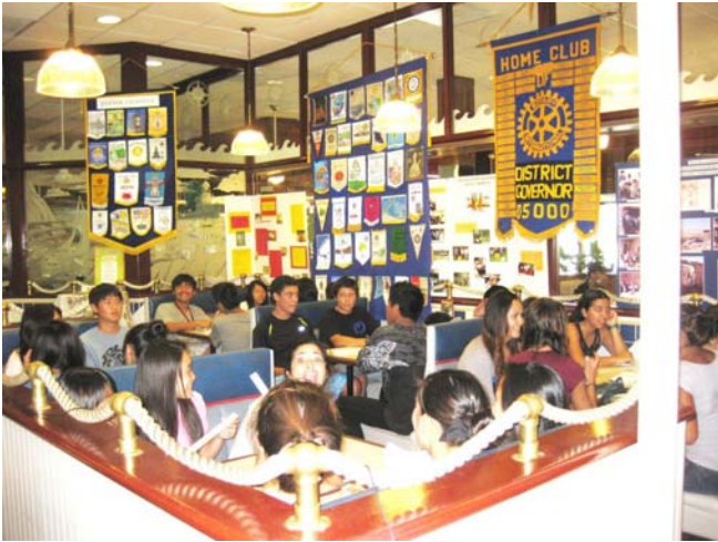
Well Dressed Room