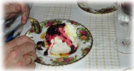
Berry Compot Pavlova