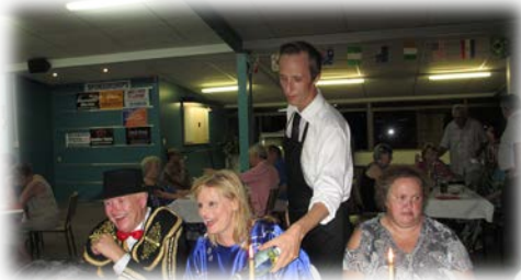
The waiter and the waited on.