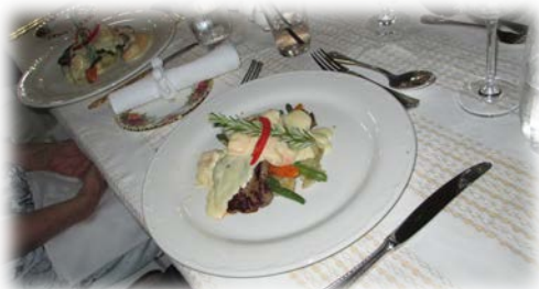
Reef and Beef