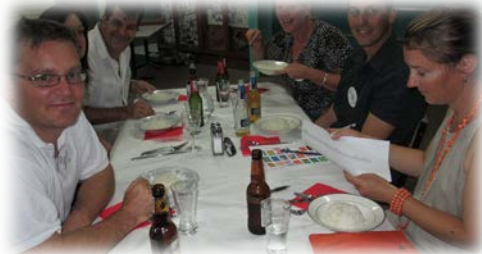
The bowl of steamed rice was not going down!