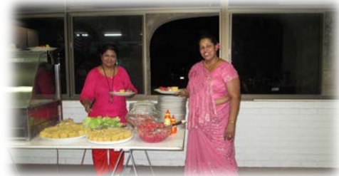
The have nots had to line up for their food- but served by the lovely ladies from the Multi-cultural Society.