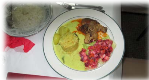
Sri Lankan curry chicken, Pittu, potatoe curry and chutney- which was yummy!