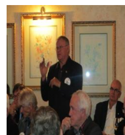
Some questions from Murray