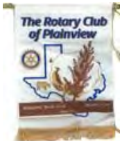
Club of Plainview (Plainview, Texas)