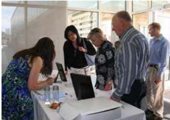
Menzie family shopping