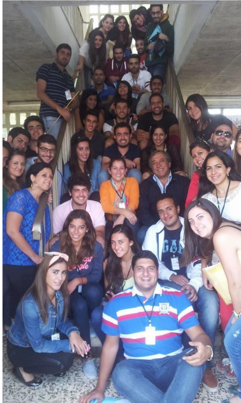
Amman Westerners visit with Rotaractors at the RYLA in Schindler Marka. (great spirit )

Rotaractors ... check Rotaract Amman West Facebook page for news