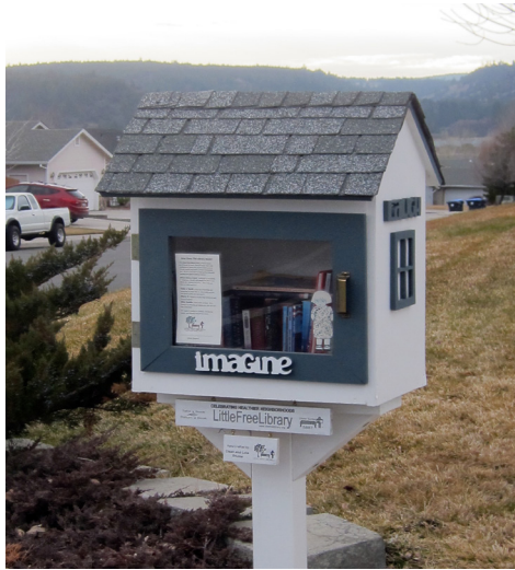
Little Free Library in Susanville