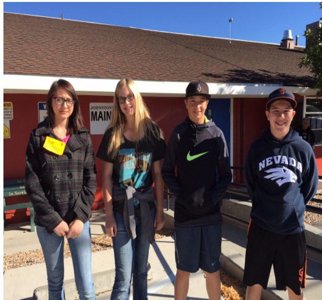
Johnstonville REGL (Rotary Eighth Grade Leadership) students ready for the trip to Grizzly Creek Ranch.