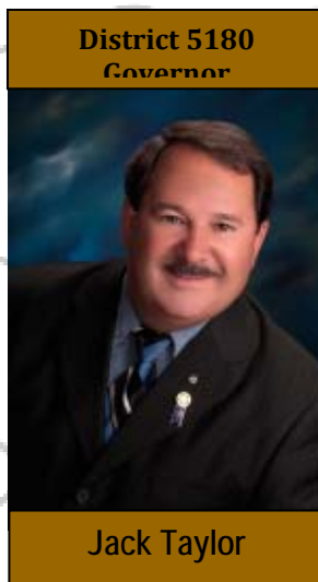
District 5180 Governor