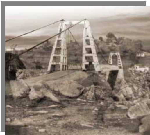
Suspension Bridge (where Rainbow Bridge now stands) Folsom, approx 1860