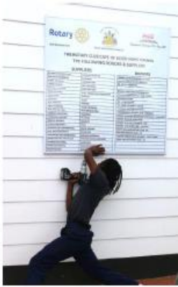
Last minute handwork