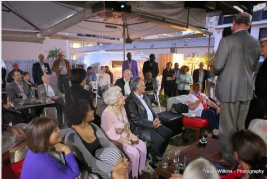
The gathering on the rooftop of the Grand Daddy Hote

“CTRC, the ‘Mother’ Club has spawned many a Rotary Club in and around this city, both directly and indirectly. It has started and still runs numerous valuable projects and has achieved much during all these years for the benefit of all its communities, with a targeted focus on the poor and needy. Our projects cover education at many levels, feeding schemes, health, caring for the elderly and creating opportunities for especially the youth to give them the essential kickstart in life.”