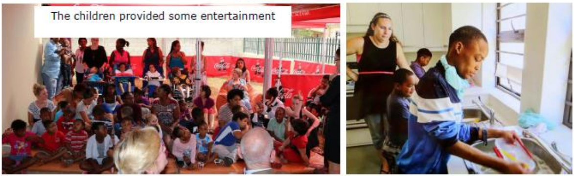
The children provided some entertainment