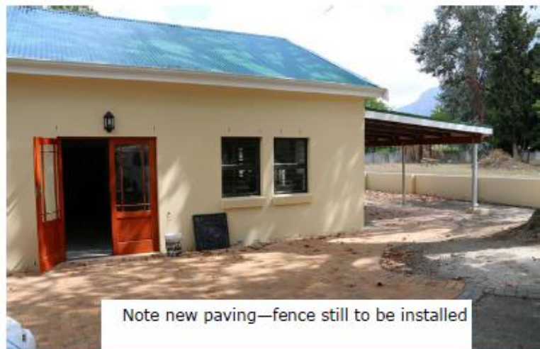
Note new paving—fence still to be installed