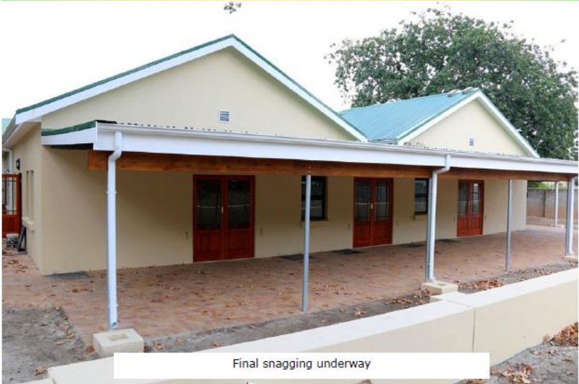
Final snagging underway