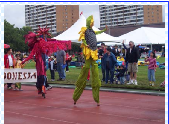
Getting a bird's eye view from above