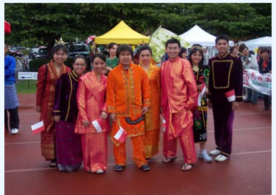
Indonesia brings out the sun with a colourful display

A day that started with torrential rain, soon gave way to brilliant sun as the colours of 33 different countries paraded around Minoru Oval. Add to that the tastes from a dozen delectable food stalls - representing everywhere from Turkey to Bali - and the recipe was complete.