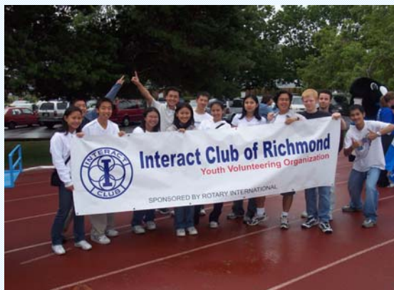
Interactors joined in with enthusiasm!