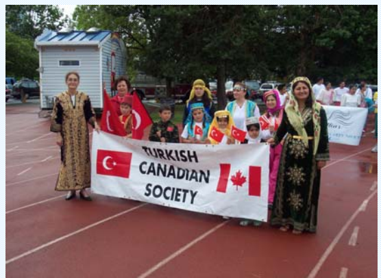
The elegance of Turkish National Dress