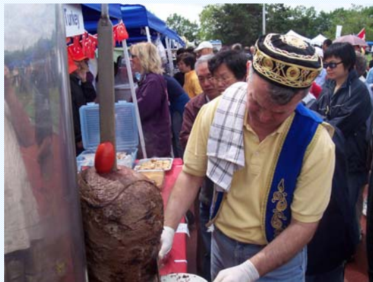
Lunch was Donar Kebab for many of the audience!