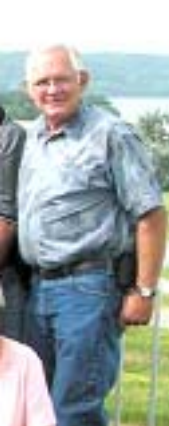
...njoy a scenic ...ry.