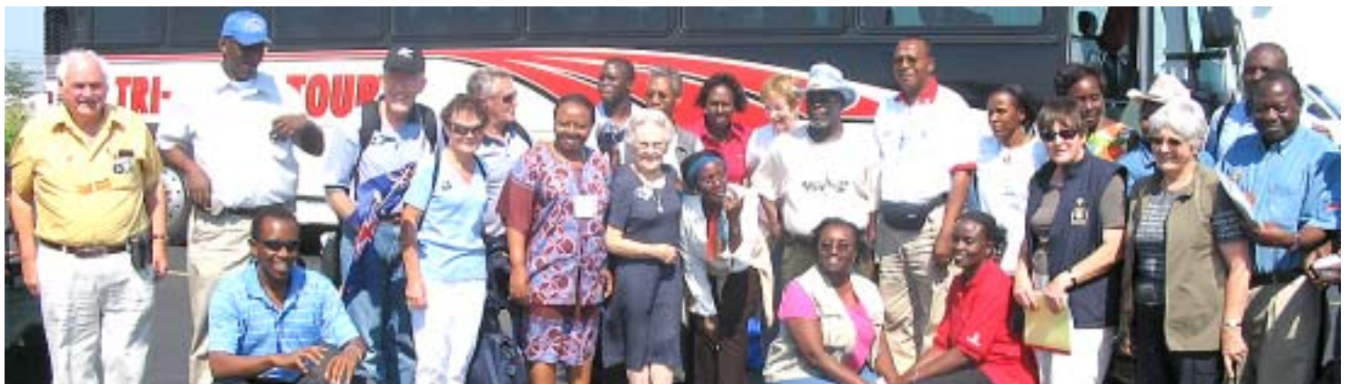
D-6000 Rotarians hosted a Friendship Exchange team from Uganda, pictured at Tipton Rotary, after the Chicago Convention.