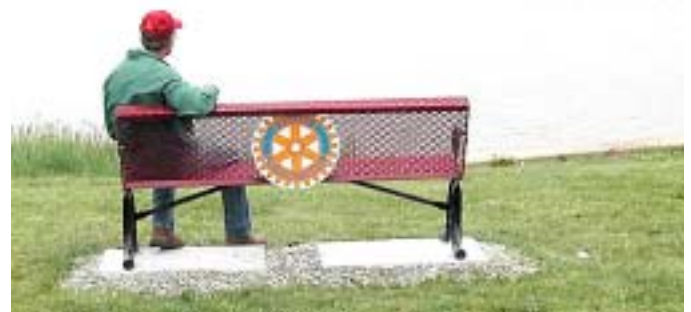
A Rotary Foundation District Simplified Grant assisted the Ottumwa Rotary Club in providing benches for a recreational area near the Des Moines River.

Get creative and consider what can be done in your local community. Talk to your club president and fill out the forms and submit them to the DSG Committee by Sept. 9, 2005.