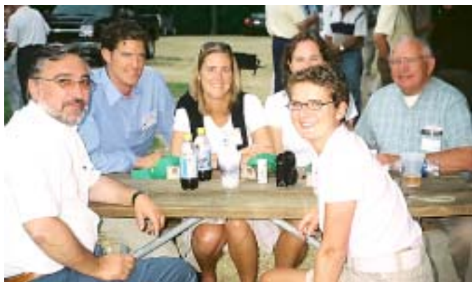
At District Conference, members of the GSE team from D-1890 in Germany enjoy the Bettendorf Rotary steak fry that was attended by 200 at Scott County Park.