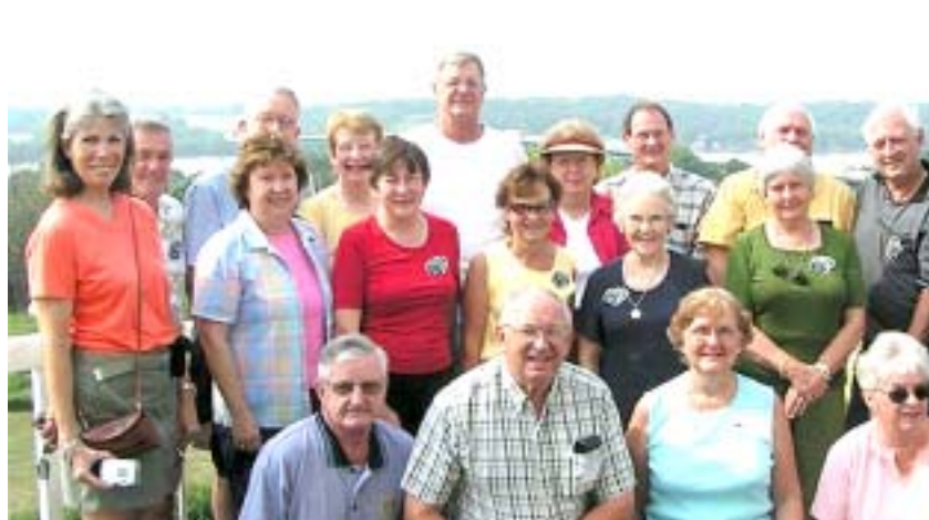
Members of the Friendship Exchange team from New Zealand enjoy an overlook of the Mississippi River with their hosts from North Scott Rotary.

'How can there be peace in the world if people don't know each other? They know each other if they