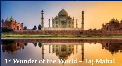
1 st Wonder of the World – Taj Mahal

Fellow Rotarians helping at Polio Booths