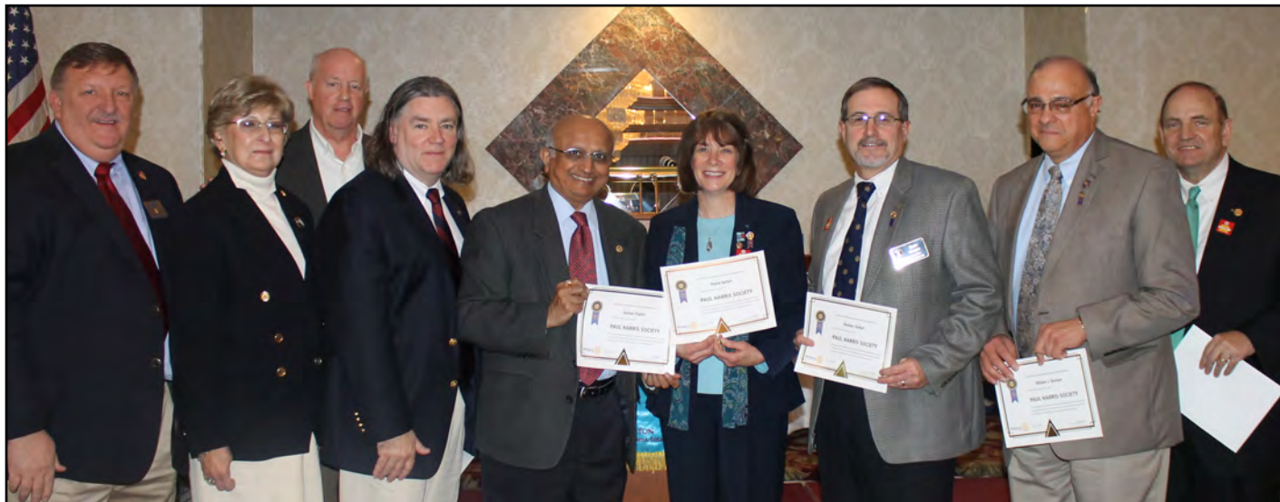
CONGRATULATIONS TO THE NEWEST PAUL HARRIS SOCIETY MEMBERS Left to Right