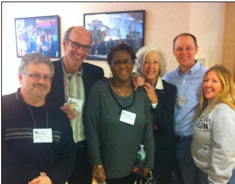
West Orange Rotary Club members attend Rotary Leadership Institute