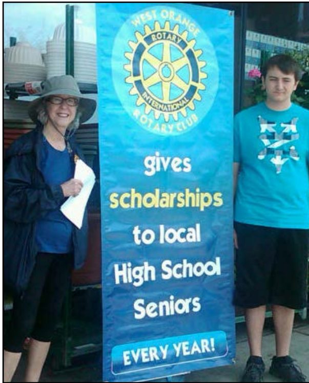
West Orange Rotary Club Food Drive Interactor