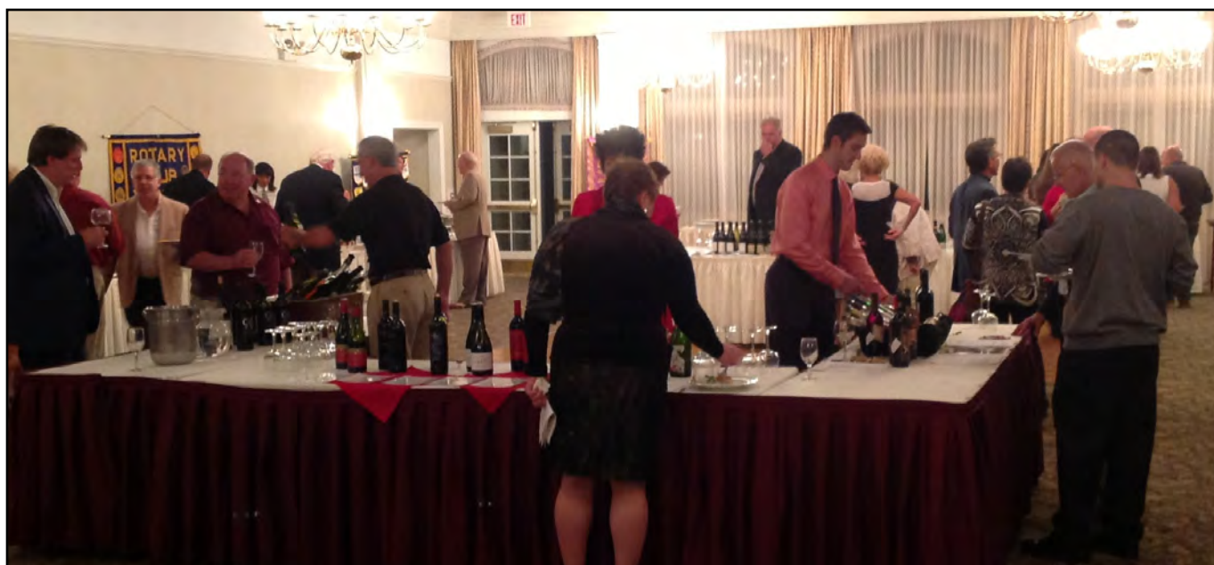
Denville Rotary Club held their annual food and wine tasting event. Many local restaurants were there to help make the evening a success.