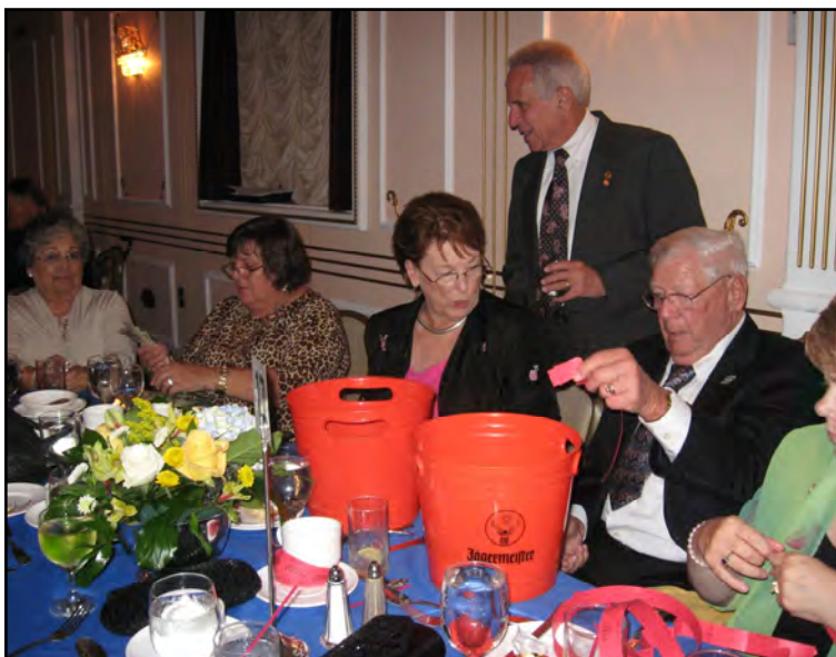
Members of the Morris Plains Rotary get ready for the 50-50 drawing.