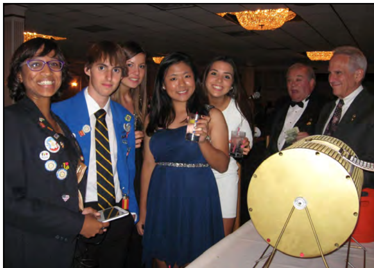
YEP students help with the 50-50