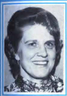
First Lady ROSE