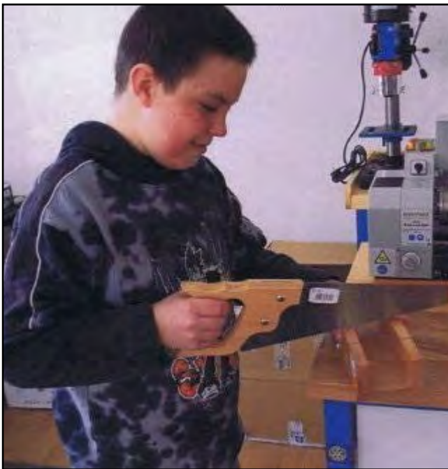
Foundation Grant provides training for a young person in Romanian orphanage.

Locally, we have had strong participation in District Simplified Grants that have benefited many near and far. These grants have aided a day care center in Morris County; purchased diapers for the needy locally and encouraged the provision of