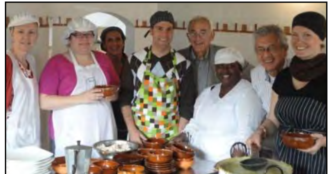
Cooking lessons with Villa deLeyva Rotary