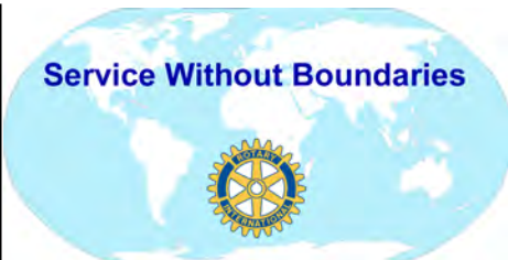
District 7470 Governor Avinash (Avi) Tilak