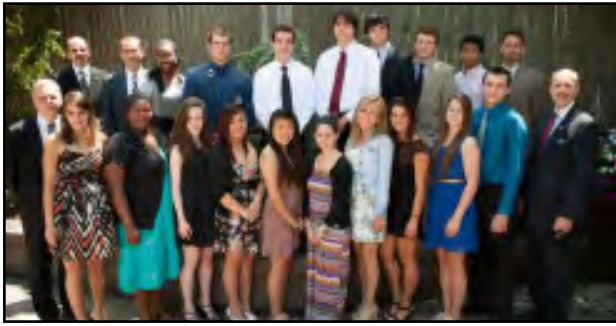
West Orange Rotary Club