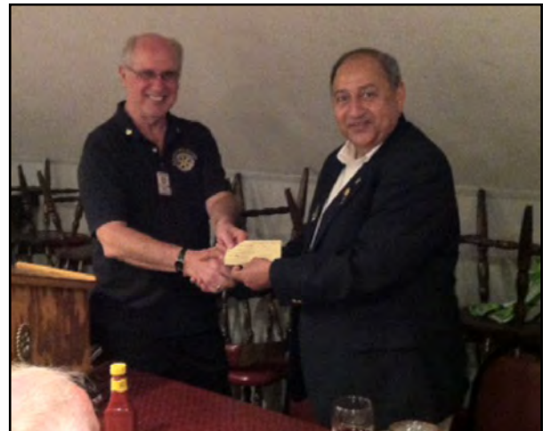
Governor Avi receives check for Polio from Blairstown Rotary