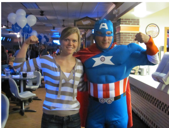
Who is that masked man?

Callout: "[...] More than the money, the great achievement is making people aware that there are 1.1 billion people—that's 1 out of every 6 people in the world—who do not have access to safe, clean drinking water." ~ Katie Spotz