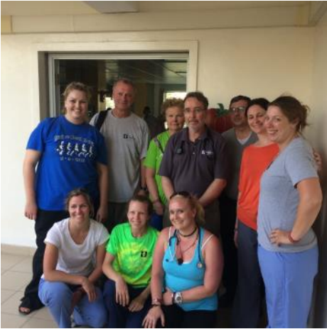
and twelve in Haiti. The program has

and participate in the bedside care of the patients during that time. The twelve