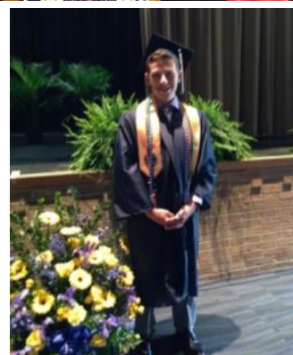
h O M # k VU 7 k u k o