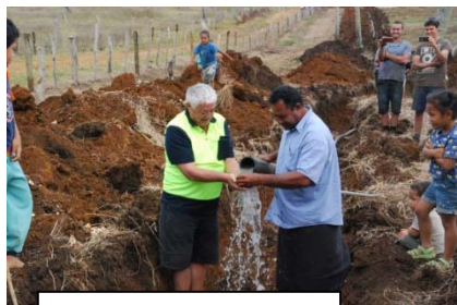
The first water flows!

The Project Objective was to provide a reliable water supply for the College to enhance health and hygiene of the students, staff and their families...AND to enable the College to re-establish revenue earning food production activities. There were a number of facets to this wonderful project and for full details and more photos please go to www.district9820.org . To see the value of the project this excerpt from an email by Kavamone saying "Good news for Hango Water Supply, that they feed all Eua Island in the last 3 months..." shows how things multiply!