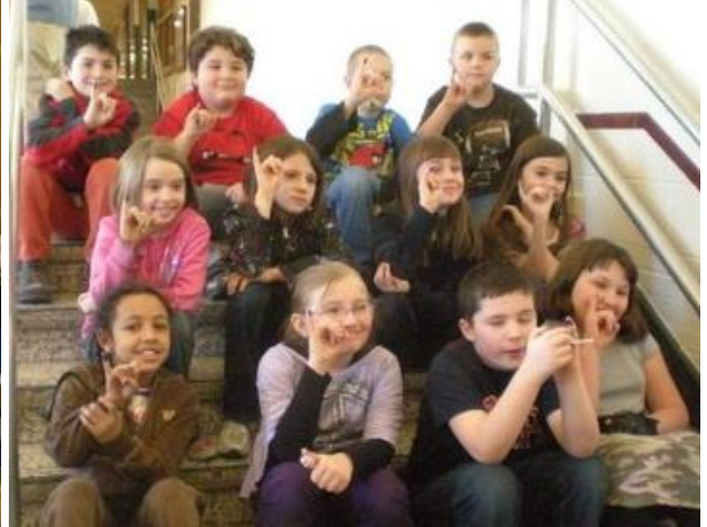
Waterford Halfmoon Union Free District Elementary

Students and Staff show their Purple Pinkies attained at Mechanicville Rotary's 4 th Annual Purple Pinkies Day. Related story on page 5