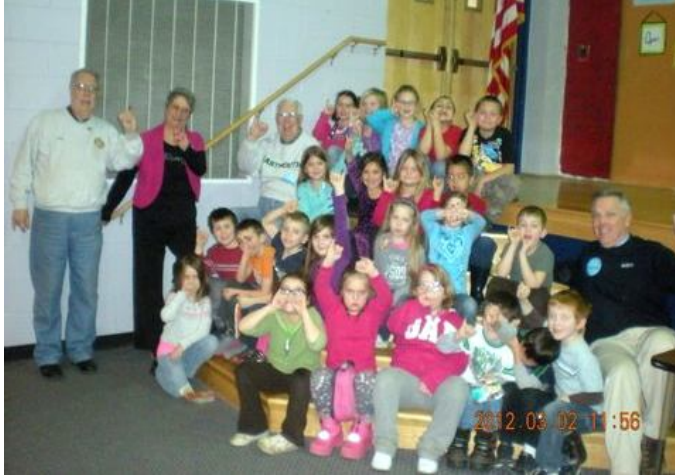
Hoosic Valley Elementary