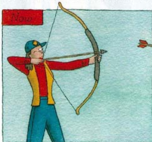
Under Future Vision, global grants fund projects in six areas of focus...