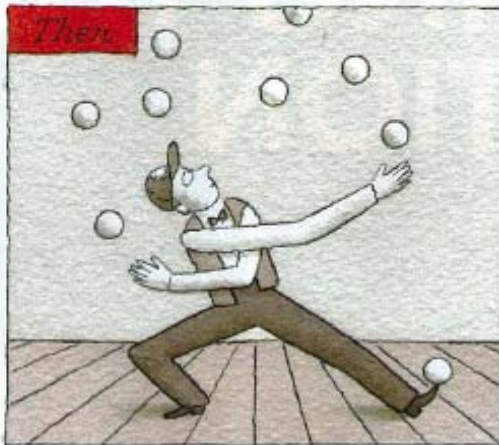
Grants funded all kinds of projects and activities...