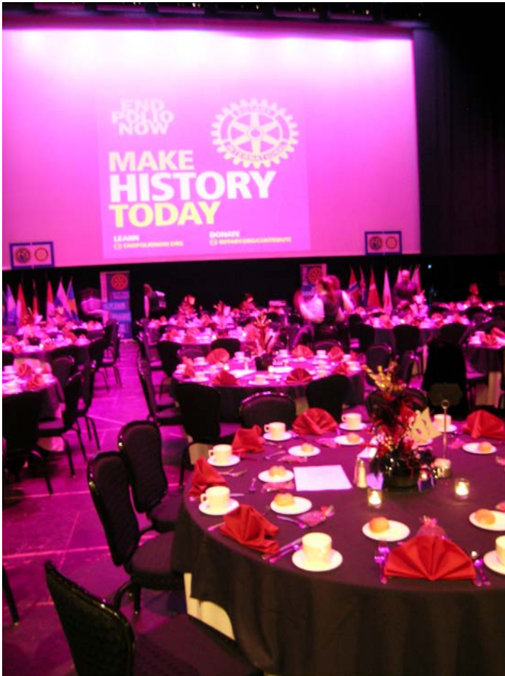
Foundation Event photo from the main stage.