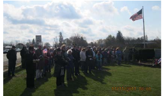
Veterans Day Service