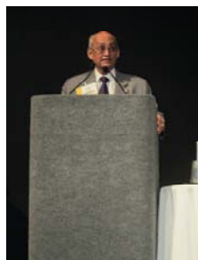
RI Pres-Elect Banerjee