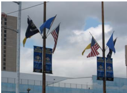
Banners welcoming Rotarians lined the streets of New Orleans.

Rotterdam Sunrise Rotary presents its 33rd Annual