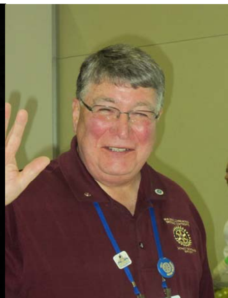
RI Convention New Orleans 2011