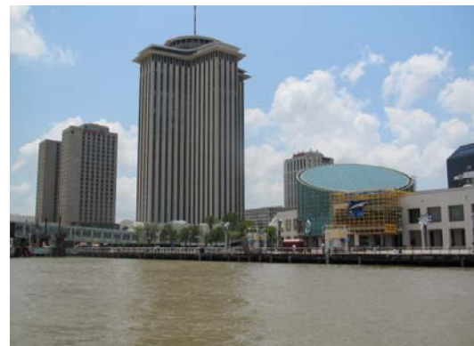
New Orleans coastline