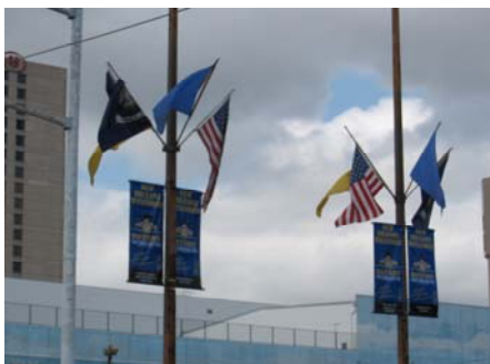
Banners welcoming Rotarians lined the streets of New Orleans.

Rotterdam Sunrise Rotary presents its 33rd Annual