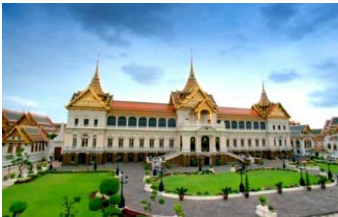
Bangkok, Thailand May 6-9, 2012