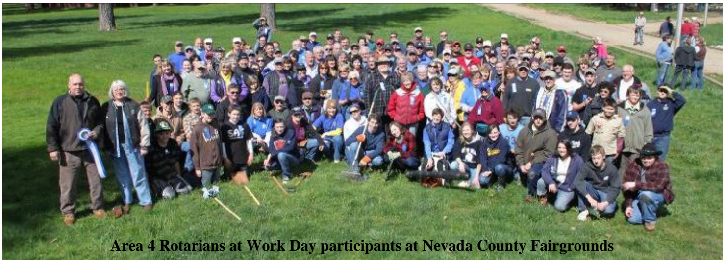
Area 4 Rotarians at Work Day participants at Nevada County Fairgrounds

Sparks: Club Service, Membership Gain, Fundraising per capita, Club of Excellence. Auburn: Vocational Service, Community Service, Literacy Project. Reno: International Service, Club Service Project. Nevada City 49er Breakfast: International Service Project, Best Bulletin, Attendance, Rotary Foundation Annual Program per capita and Total Giving per capita. Grass Valley: New Generation Service, Rotarians at Work. Cameron Park: Community Service Project, Club Website. Truckee: Vocational Service Project, New Generation Project.