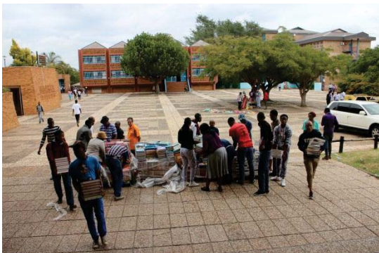
Students carrying the books into RWC

The Reading & Writing Centre, being a new establishment under the auspices of the University's Centre for Academic Excellence, is now the proud owner of over 2000 books on diverse learning areas. On the morning of delivery, the students serving as RWC Language Consultants, together with volunteering students, formed a human-chain conveying the donated books from the drop-off point outside the Main Library, down the stairs, into the RWC venue. The pictures below talk to the event in question.