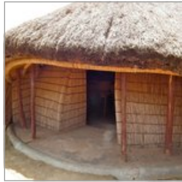
Kasubi Tombs, Kampala