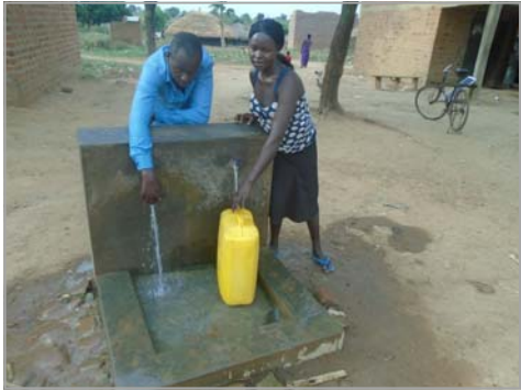
Water Distribution Post, Barlonyo